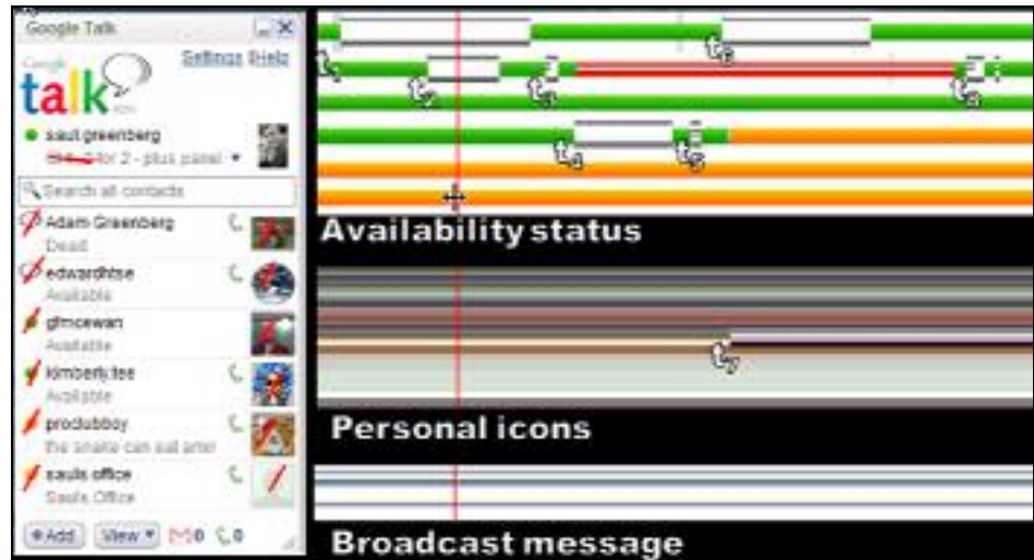
Figure 10. On-line status and talk in GoogleTalk

These examples show how tear-based video-slicing can reveal particular patterns to an analyst. These are generalized below.