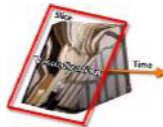
Figure 4. A sliced video cube, modified from [6]

as a video cube [5]. Chung et al. illustrate several methods of rendering this cube, and show how rendering successive frame differences can be a compelling summarization of the video data [2]. Fels et al. provide another visualization by slicing through this cube using a cut plane thereby crossing both time and space (Figure 4). Slit-scanning can be viewed a subset of this method, as it realizes the specific case of an intersecting plane being placed perpendicular to the face of the cube. Video volumes are more general, as different effects can be achieved by using other geometric slicing shapes and other slicing positions.