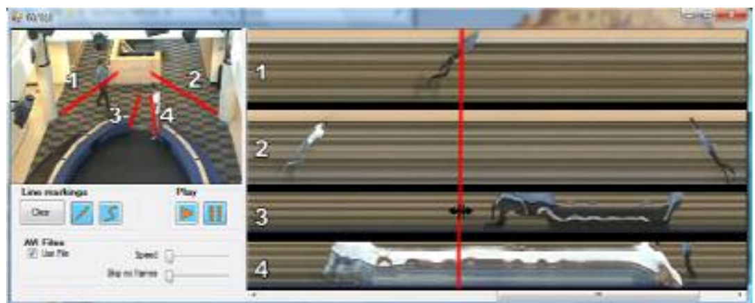
Figure 6. Screen snapshot of our slit-tear video slicing system.

Users can create one or more slit-tears atop the live video frame, using the line or sketch tool (Figure 6, bottom left). In the figure, the analyzer began by sketching tear 1 atop the frame to capture traffic going through the left doorway. Similarly, tear 2 captures the right doorway, and tears 3 and 4 capture movement and activity around the opening to a seating area. All lines were drawn from the top down. This generates the visualization, where we see four horizontal regions representing the frame pixels underneath these lines stacked atop each other (in this image, each region is separated by black, and numbered to show the slit-tear line it represents). As in Figure 5, moving left to right in the timeline visualization, we see one person wearing a white shirt and blue pants has quickly walked through doorway 2 (2 nd row),