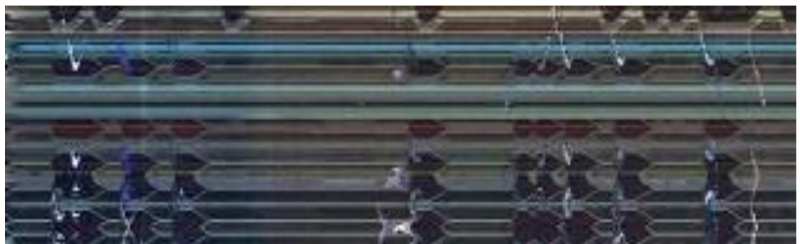
Figure 8. Several minutes of the same scene shown in Figure 8

One of the strengths of slit-tear visualization is that it allows us to easily see not only individual events, but patterns in the scene. By patterns, we refer to how events relate to one another over time. Because the tears traverse space, and the timeline traverses time, temporal patterns of movement and behavior are visualized