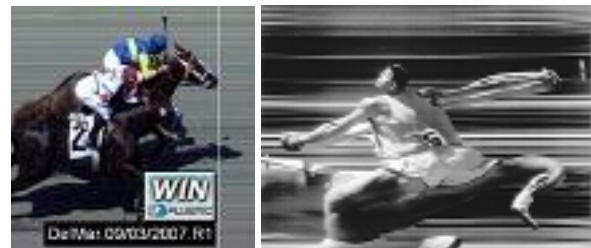
Figure 2. Slit-scanning. (a) judging photo finishes, from [4] (b) George Silk Hammer Thrower, from [13].