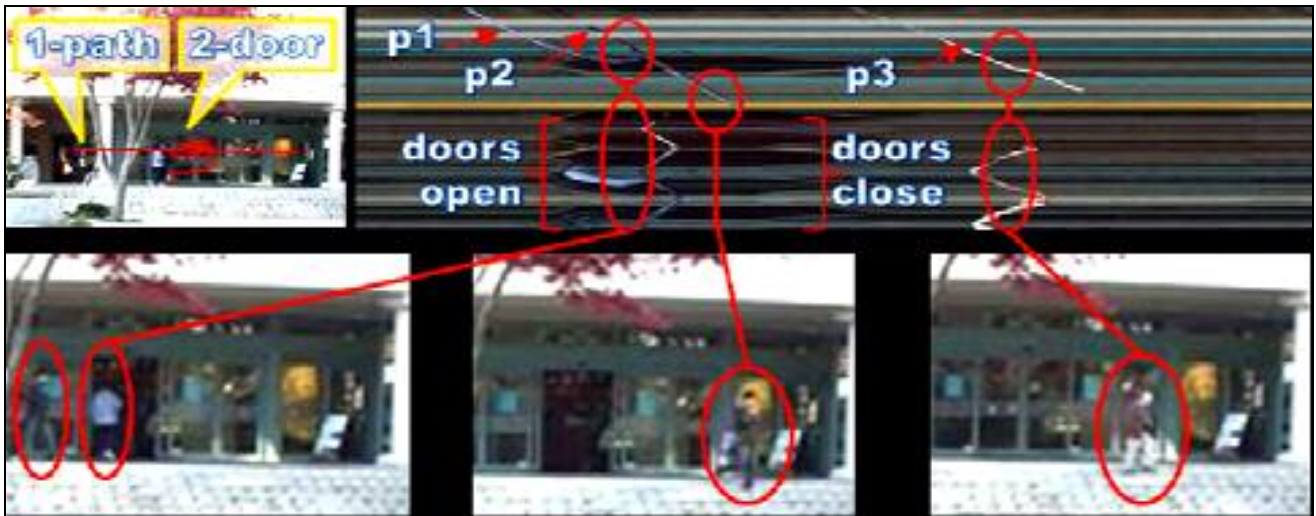
Figure 7. Monitoring pedestrians entering or passing by a store in an outdoor mall. Annotations show door and people events.

and then pauses by the opening (4 th row). Shortly afterwards, the 2 nd person wearing a blue shirt and black pants comes out of the left door (1 st row), lingers at the opening along with the 1 st person (3 rd and 4 th rows), and then leaves through the right door (2 nd row). The first person disappears by continuing through the opening (the blur as he leaves suggests his direction of movement).