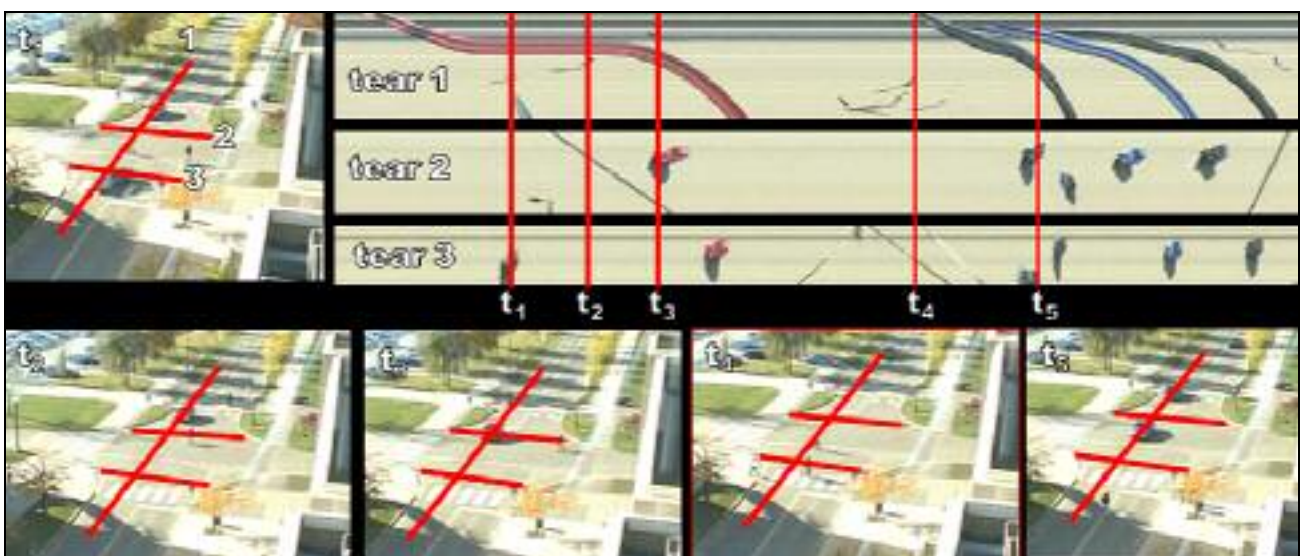
Figure 9. A traffic intersection showing the interaction patterns of cars and pedestrians