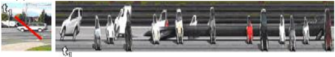
Figure 11. Car speed through an intersection

In contrast, slit-tear visualization is a general approach for video collection and analysis that can augment other approaches. It requires no specialized equipment aside from an off-the shelf digital video camera, a tripod, and a computer for generating the visualization. It can be used in a broad variety of settings. This