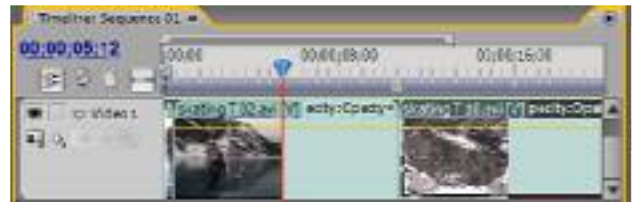
Figure 1. Adobe Premiere Pro CS3 Timeline

Video volumes. We can also consider a video clip as a volume, where successive video frames are stacked atop one another, i.e.,