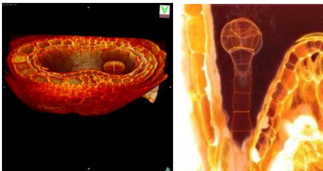
Fig. 1 An A. thaliana embryo inside seed.

INRA/MaIAGE and INRIA/AVIZ join their efforts to create efficient software for the investigation of complex image data in the live sciences. Specifically, we are investigating the early development of plant embryo which can be observed in 3D light microscopy at different stages of the development. Even with a single 3D image (Fig. 1), much of the needed information can be traced back and some traits of the history of the embryo can be inferred. In order to analyze and compare some traits of the development efficiently we need specific graphical interfaces to assist researchers in the construction of lineage trees (Fig. 2). The design and implementation of this interface are the core aspects of the internship and Master's research.