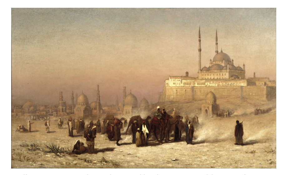
Tiffany L.C. (1872) On the Way between old and new Cairo, Citadel Mosque of Mohammed Ali, and Tombs of the Mamelukes [Oil on canvas]. Brooklyn Museum, Brooklyn